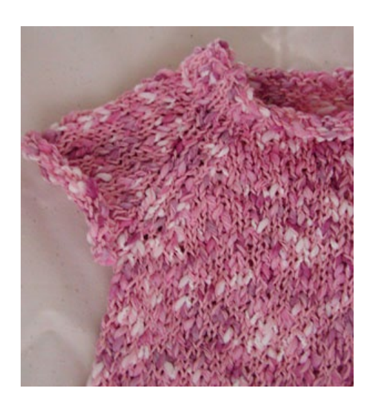
copyright 2004 - Midnight Knitter may be distributed freely for personal use only may NOT be re-printed on the web

st st = stockinette stitch k2tog = knit 2 sts together