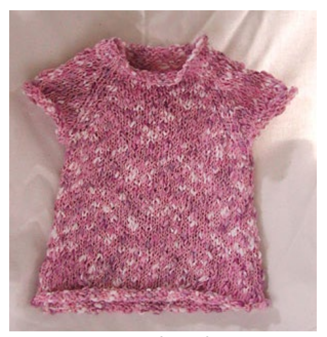
Cotton Candy Cap Sleeve

Wide bell-shaping allows for the same size to fit a variety of ages, looking cutely oversized on smaller girls and a nice tight fit on older girls