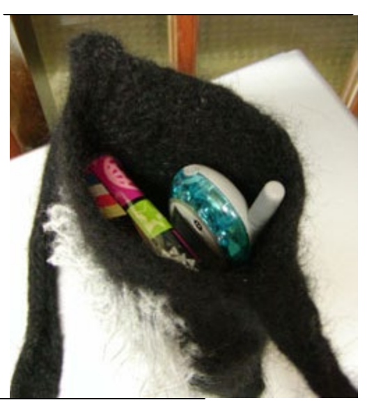
copyright 2004 Midnight Knitter may be distributed freely for personal use only