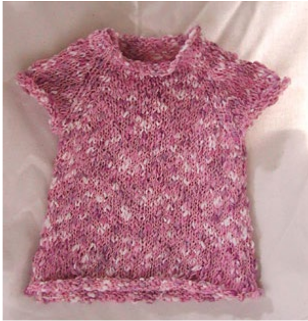
Cotton Candy Cap Sleeve