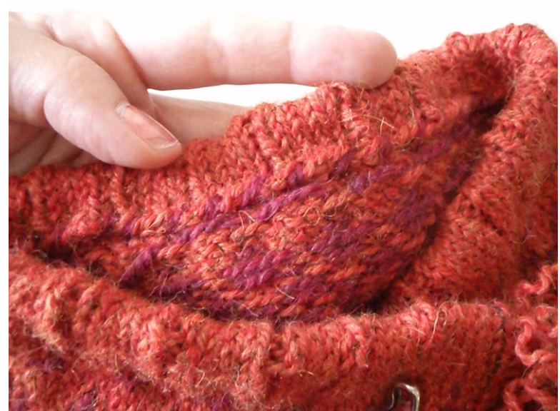
Sewn cast-on edge, see FINISHING section for instructions.